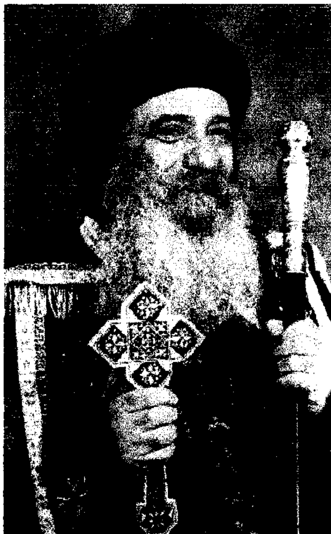
POPE SHENOUDA III, 117th POPE OF ALEXANDRIA AND THE SEE OF ST. MARK