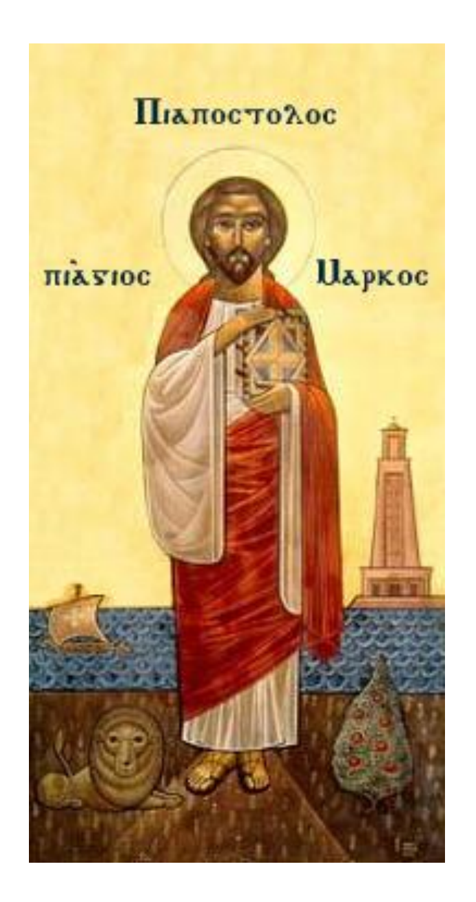
Saint Mark The Apostle