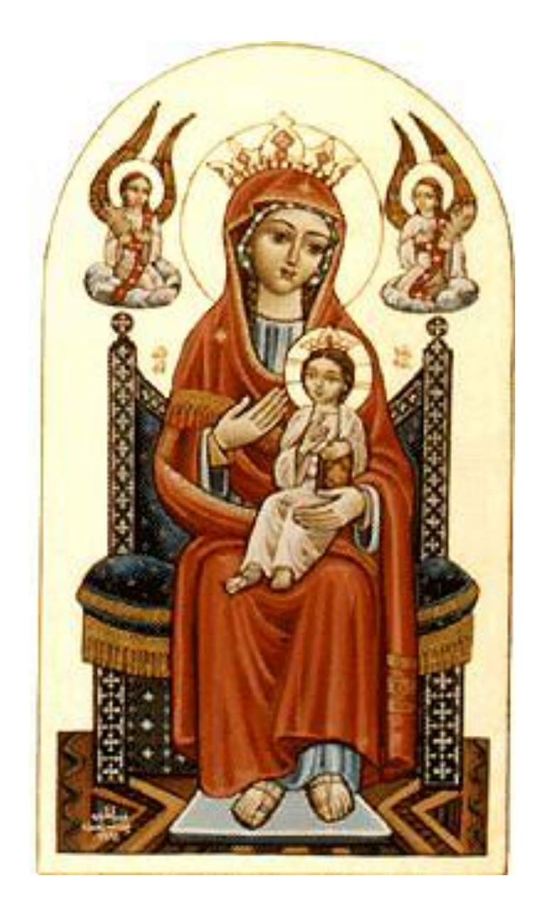
The Virgin Saint Mary Mother of God