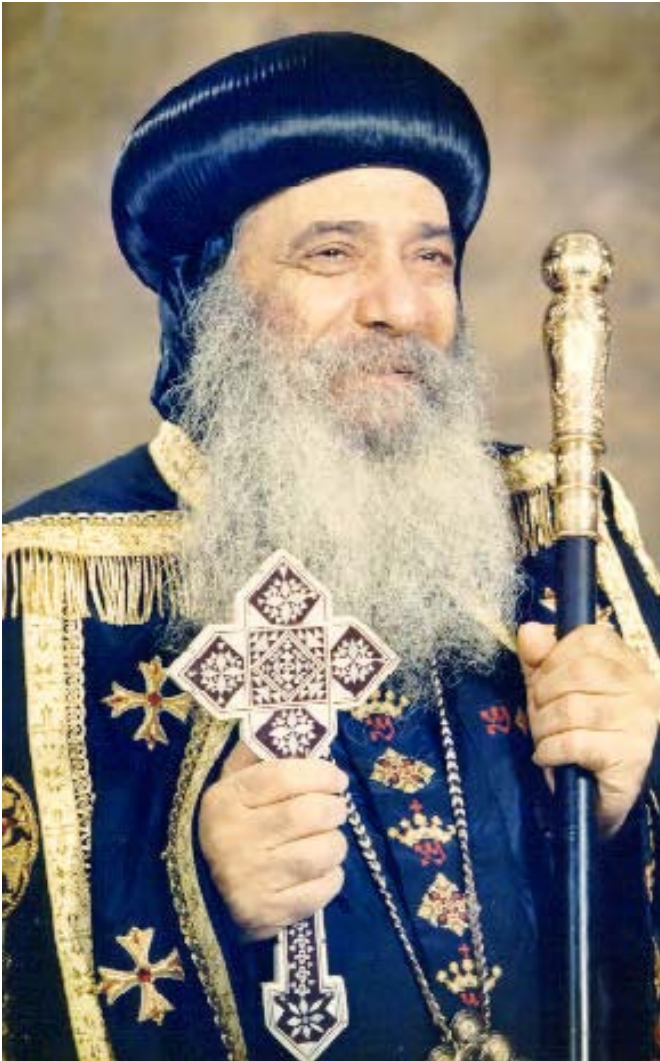
H.H. Pope Shenouda III, 117th Pope of Alexandria and the See of St. Mark