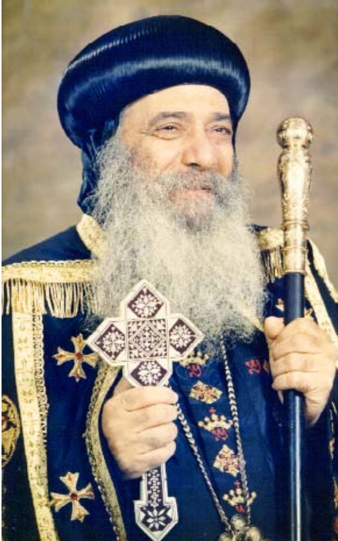
H.H. Pope Shenouda III, 117th Pope of Alexandria and the See of St. Mark