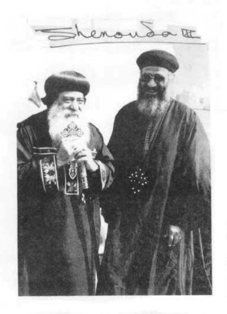
The Author with H.H. Pope Shenouda III in his historical visit in America, 1989