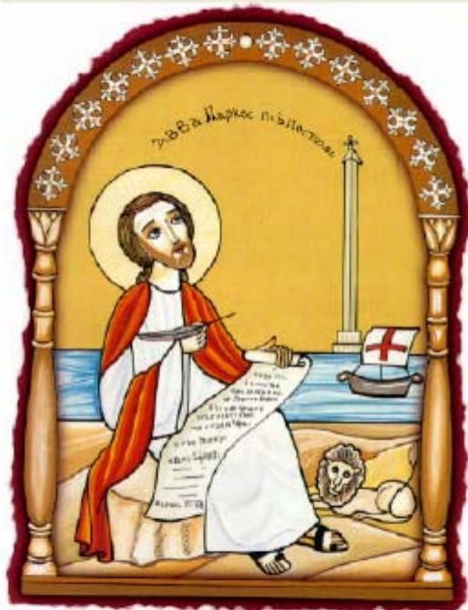
THE BEHOLDER OF GOD MARK THE EVANGELIST SAINT AND MARTYR