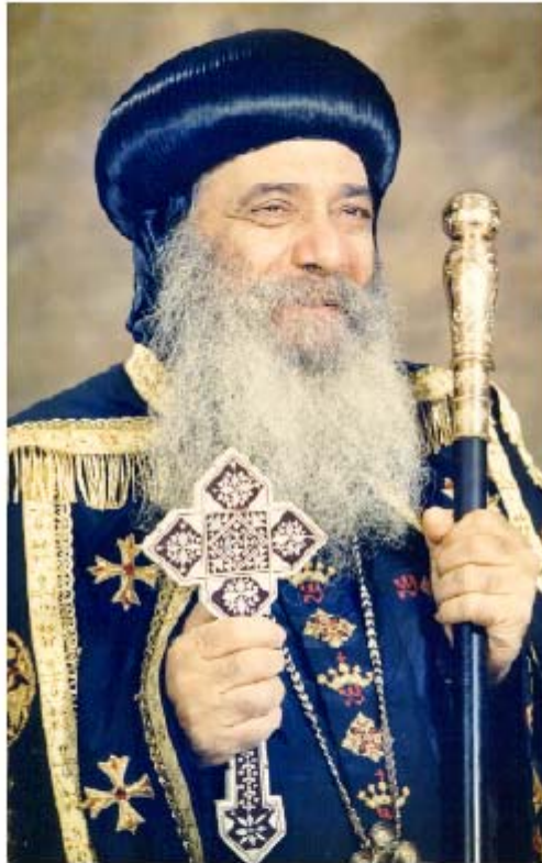
H.H. Pope Shenouda III, 117th Pope of Alexandria and the See of St. Mark