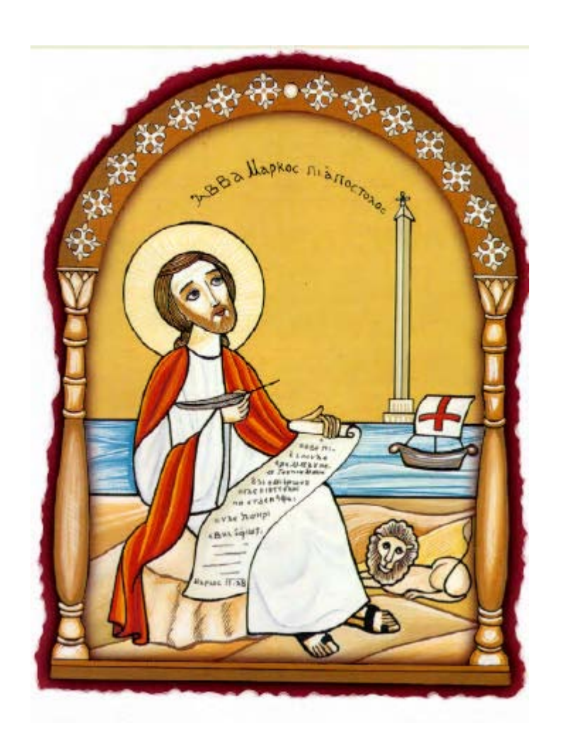
THE BEHOLDER OF GOD MARK THE EVANGELI ST SAI NT AND MARTYR