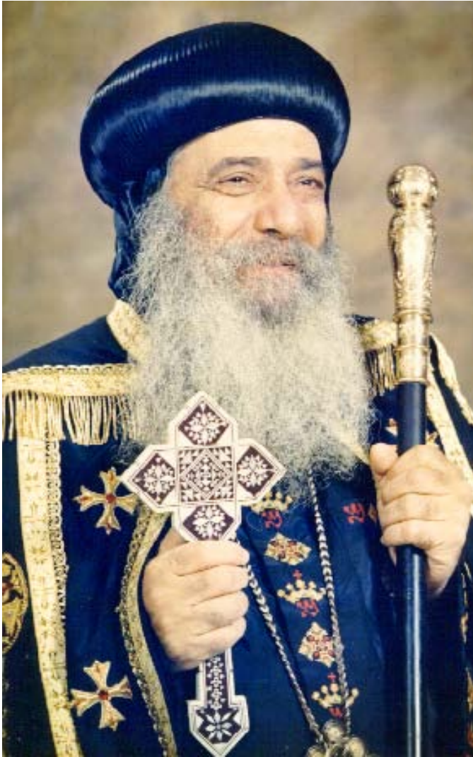
H.H. Pope Shenouda III, 117th Pope of Alexandria and the See of St. Mark