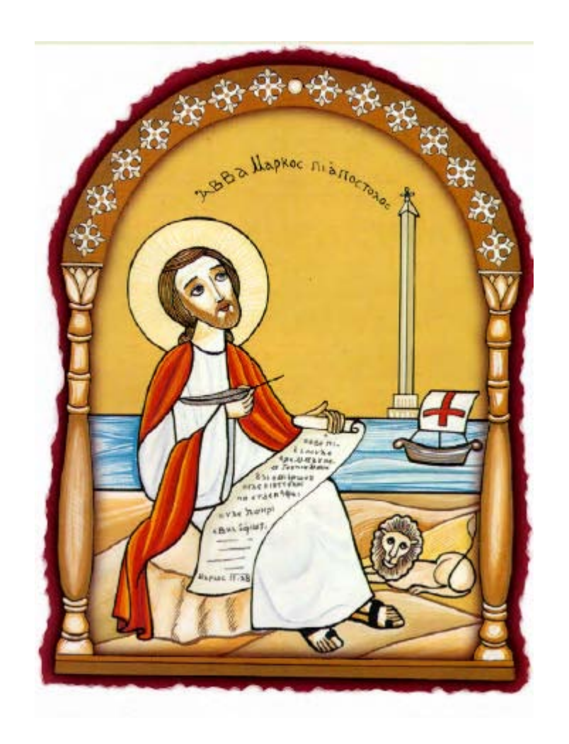
THE BEHOLDER OF GOD MARK THE EVANGELI ST SAI NT AND MARTYR