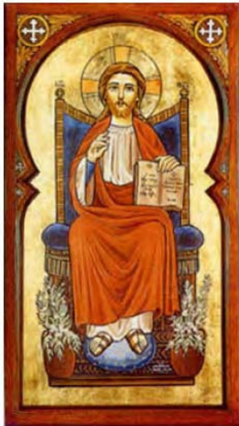
Our Lord and Saviour Jesus Christ, King of Kings and Lord of lords