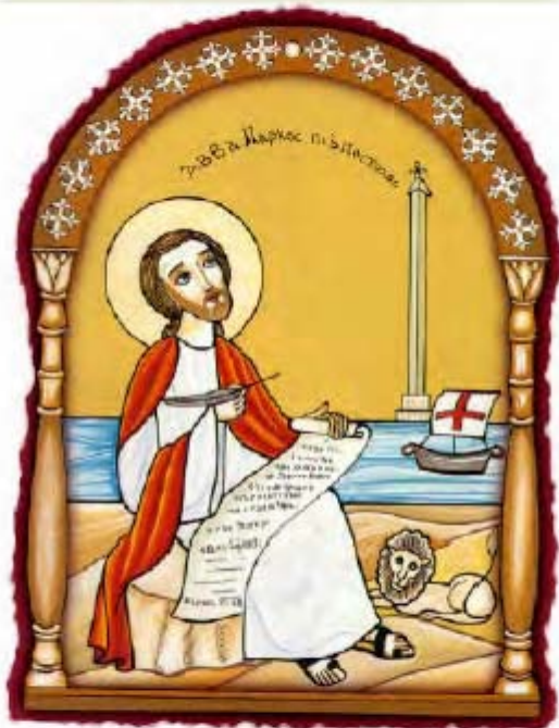
THE BEHOLDER OF GOD MARK THE EVANGELIST SAINT AND MARTYR