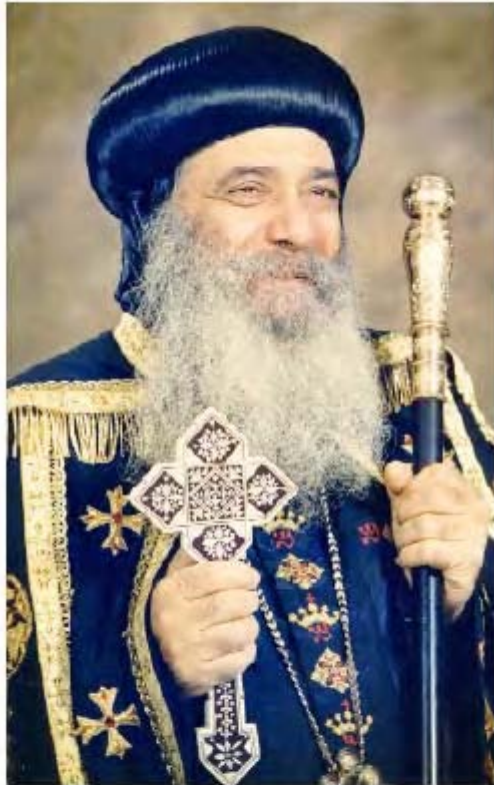
H.H. Pope Shenouda III, 117th Pope of Alexandria and the See of St. Mark