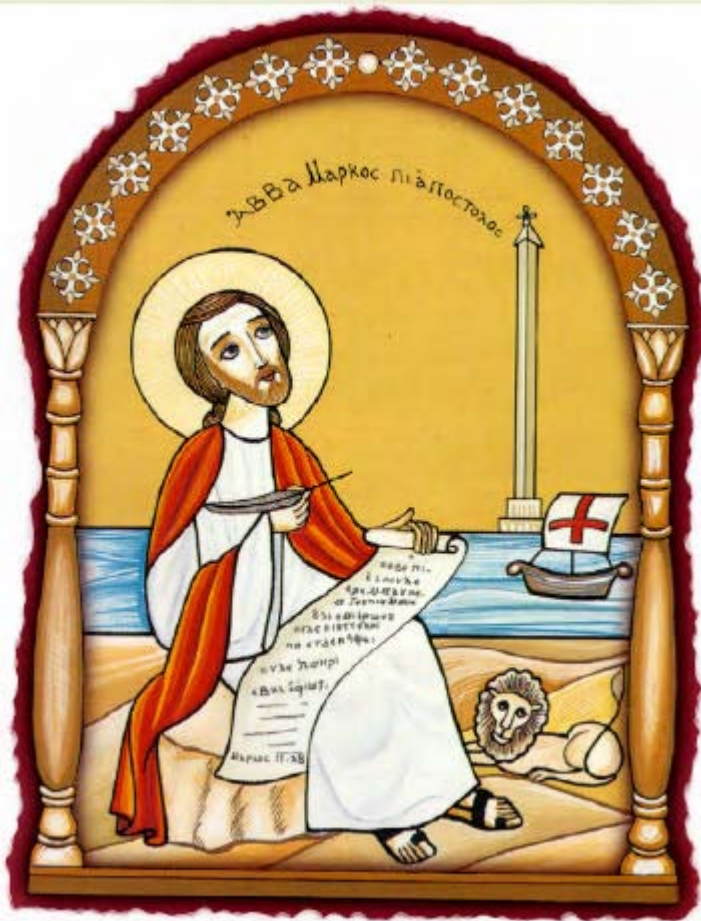
THE BEHOLDER OF GOD MARK THE EVANGELIST SAINT AND MARTYR