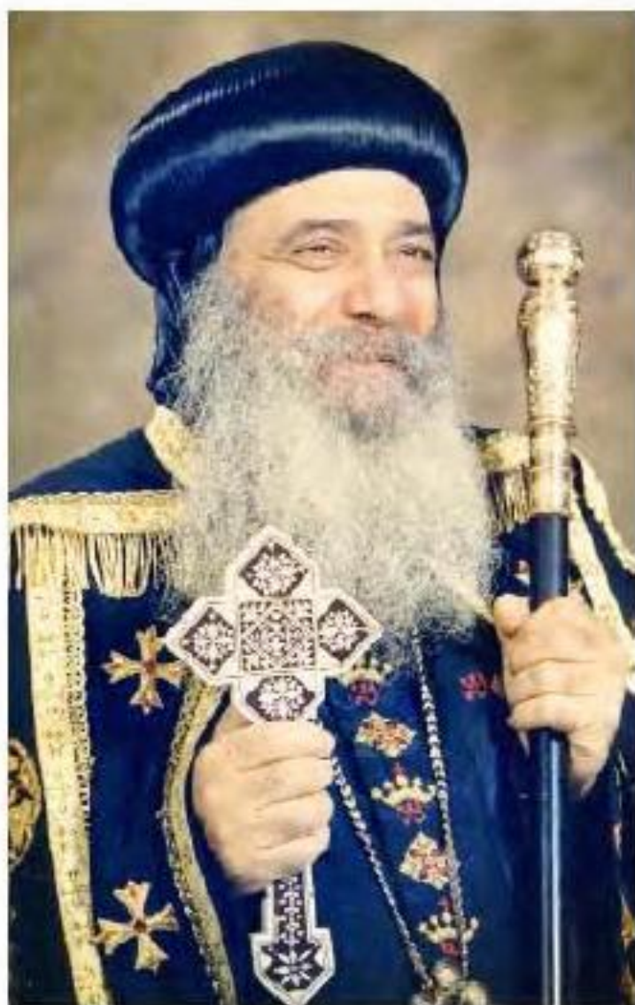
H.H. Pope Shenouda III, 117th Pope of Alexandria and the See of St. Mark