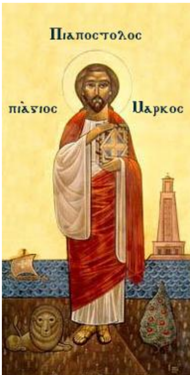
Saint Mark The Apostle