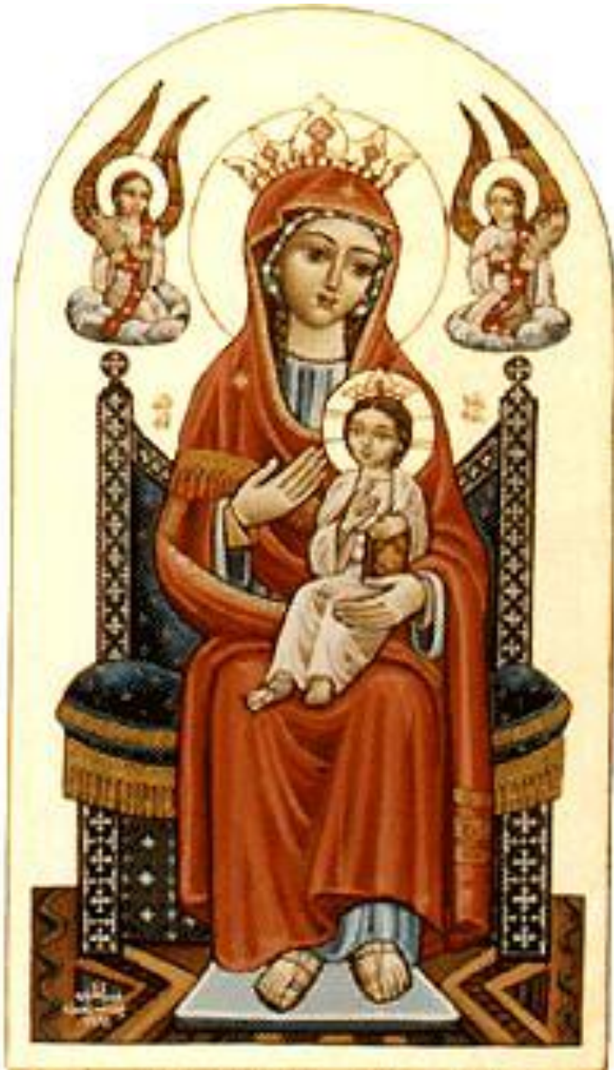
The Virgin Saint Mary Mother of God