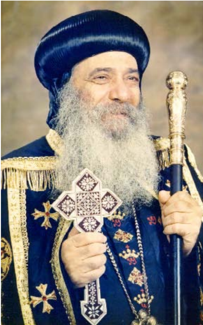
H.H. Pope Shenouda III, 117th Pope of Alexandria and the See of St. Mark