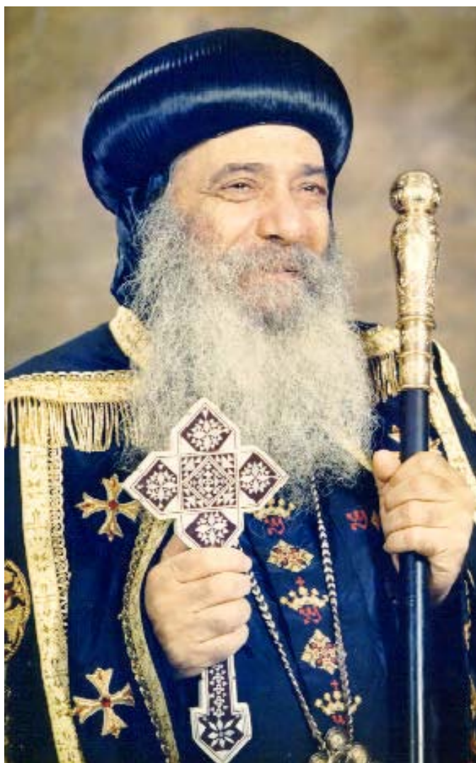
H.H. Pope Shenouda III, 117th Pope of Alexandria and the See of St. Mark