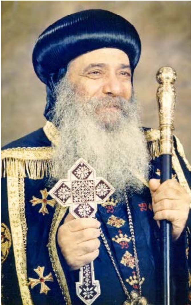
H.H. Pope Shenouda III, 117th Pope of Alexandria and the See of St. Mark